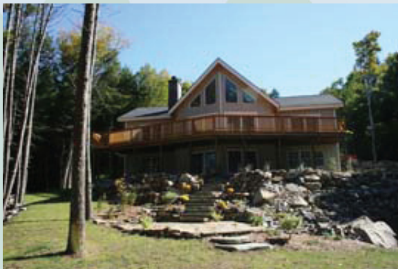
The Hilltop 3,990 sq. ft. 4 Bedrooms, 4.5 Baths 3.13 Acres, 260 ft. Shoreline $595,000