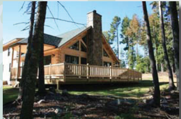
The Kathadin 2,274 sq. ft., 3 Bedrooms, 3.5 Baths 1.95 Acres, 270 ft. Shoreline $395,000

Contact: 207 454-2480 or interest@cathanceshoresllc.com www.cathanceshoresllc.com